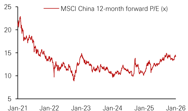
Chart 3: Valuations of Chinese equities remain reasonable